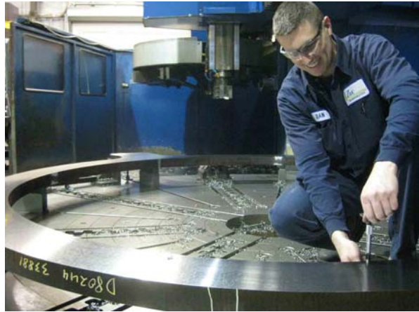
Using a micrometer for precision - Zak, Inc.