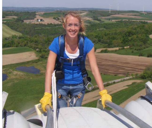
GE Wind Energy Learning Center employee, 250 feet in the air servicing a GE 1.5 MW Wind Turbine.