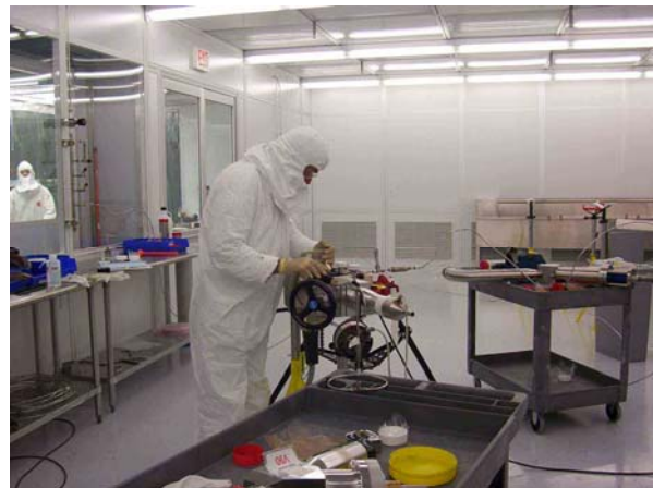
Orbital welding stainless steel tubing for a high purity gas delivery system by a TFS technician